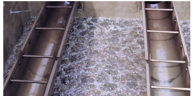
AIR SCOUR PRIOR TO WATERWASH