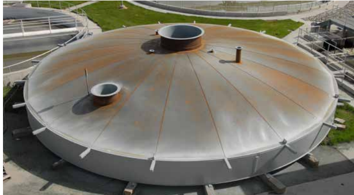
Spanish Fork STP, UT (50' F1) :

Our radial beam design includes the following configurations: Fixed, Gasholder, HydroSeal® type and Buoyant steel cover. Ovivo will provide the best option for each application based on the customer needs.