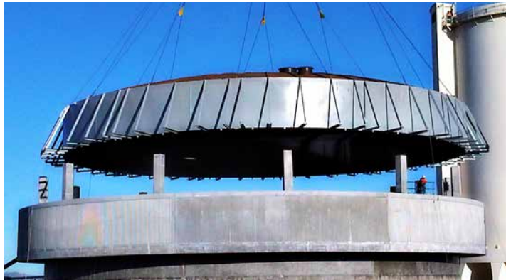
Salt Lake City WRF, UT (90' G2VL) :