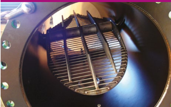
Single screen ball strainer