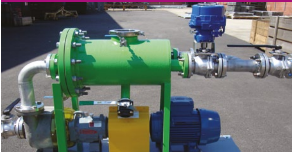
Ball recirculation pump skid