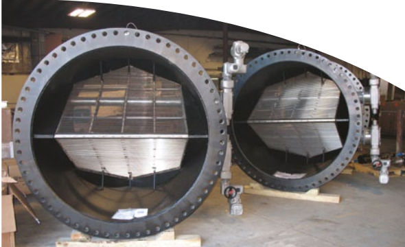
Dual screen ball strainers