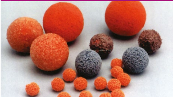
Elastomeric rubber balls