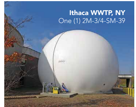
Ithaca WWTP, NY One (1) 2M-3/4-SM-39

The three membrane (Model 3M) gasholder offer several advantages over the conventional two membrane design.