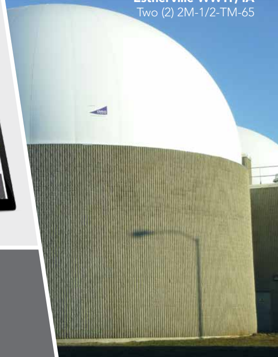
Estherville WWTP, IA Two (2) 2M-1/2-TM-65

The \frac{3}{4} sphere can increase capacity for gas storage with minimal impact on footprint size. Usually designed for slab mounted options, the \frac{3}{4} sphere can be installed on a tank if the layout permits it.