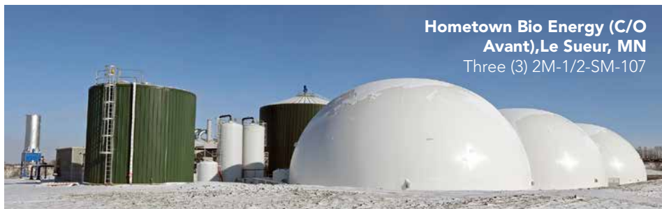
Hometown Bio Energy (C/O Avant), Le Sueur, MN Three (3) 2M-1/2-SM-107