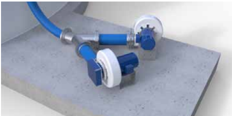
Miller Creek WWTP, WA Two (2) 2MH-1/2-TM-50

THE ULTRASTORE MEMBRANE GASHOLDERS ARE AVAILABLE IN TWO MAIN DESIGNS (MODELS 2M AND 3M); TWO MEMBRANES AND THREE MEMBRANES. BOTH OF THESE DESIGNS CAN BE INSTALLED ON TOP OF DIGESTER OR INSTALLED ON CONCRETE SLABS.